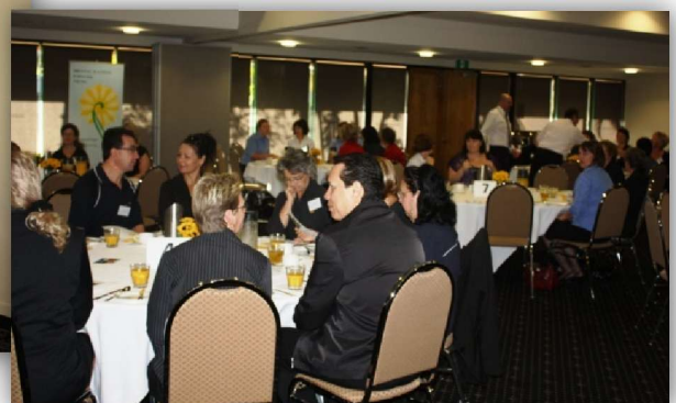
Foreground, Kith and Kin Association's table