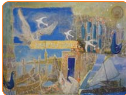
Sharyn Brady, Out of the Blue