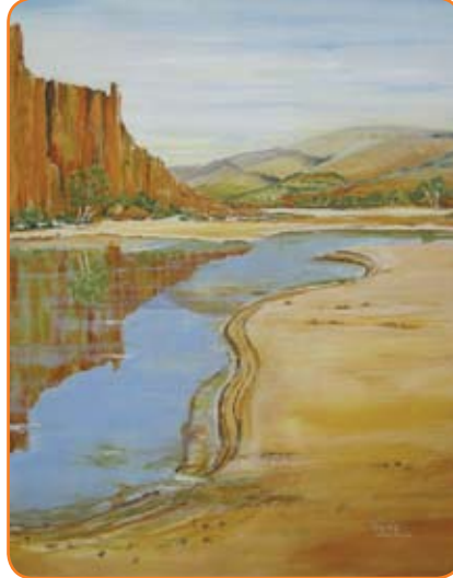
June Bridges, Fink River