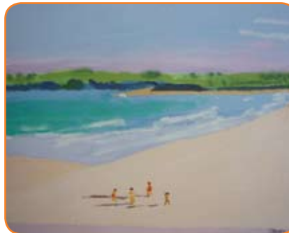
Steven Bennett, Beach Scene