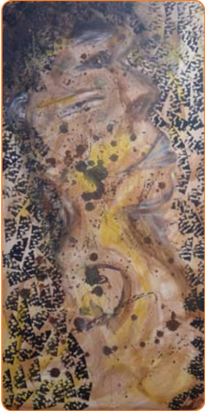
Raylene Snow, Identity