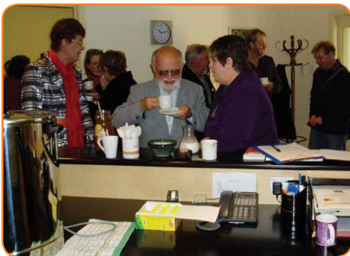
Above and below: the MIFSA Mount Gambier community share the opening of the new Mount Gambier premises

The Personal Helpers and Mentors Program in the South East Country SA area will share journeys of recovery with people living with mental illness. This work will occur in coffee shops, workplaces, schools, TAFEs, community centres, parks and homes across the region. PHaMs Program Workers will walk alongside PHaMs participants as they take a key role in managing their own mental health. We are pleased to have such a diverse work force to be able to assist participants to reach their goals.