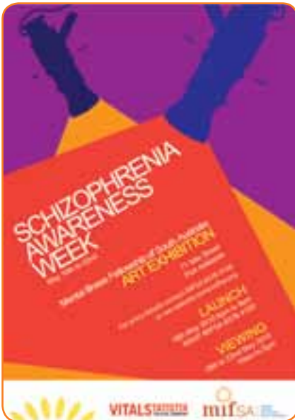
Below: snapshots of the 2009 Art Exhibition

To register your attendance at the Launch, Education and Public Forums, please phone MIFSA Wayville Reception, 8378 4100.