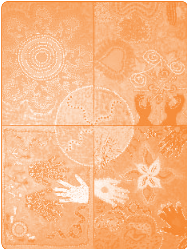
'Untitled Panels 1, 2, 3, 4,' by Nunkuwarrin Yunti Women's Healing Group

It is with great delight to announce our existing PHaMs West Program has been successful in receiving funding to continue offering PHaMs services until June 2012. In addition we have been given extra funding to increase our capacity to work with humanitarian entrants and Indigenous Australians in the region.